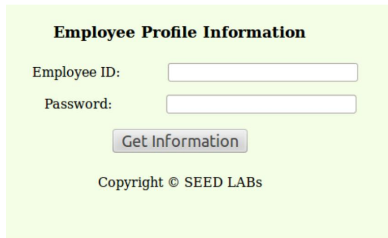
Figure 1: The Login Page

The browser starts at the entrance page of our web application at www.SEEDLabSQLInjection.com , where you will be asked to provide Employee ID and Password to log in. The login page is shown in Figure 1. The authentication is based on Employee ID and Password, so only employees who know their IDs and passwords are allowed to view/update their profile information. Your job, as an attacker, is to log into the application without knowing any employee's credential.